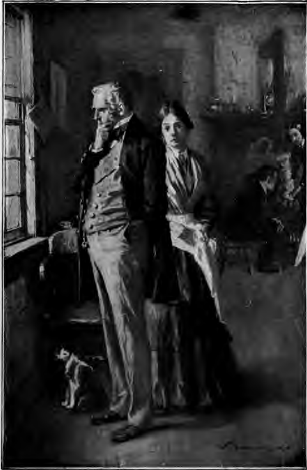
HIS AIR CASTLES CRUMBED TO RUINS